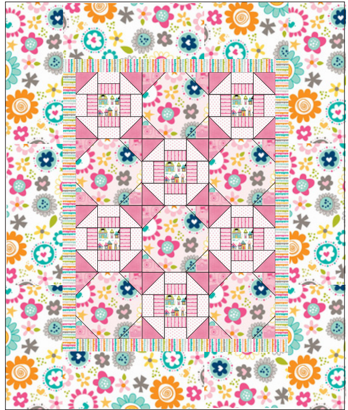
Baby size: 39" x 47" Block size: 8" x 8"

Full version contains: fabric requirements & comprehensive instructions for baby, nap, twin, queen and king sized quilts. Includes border tips, backing ideas and more.